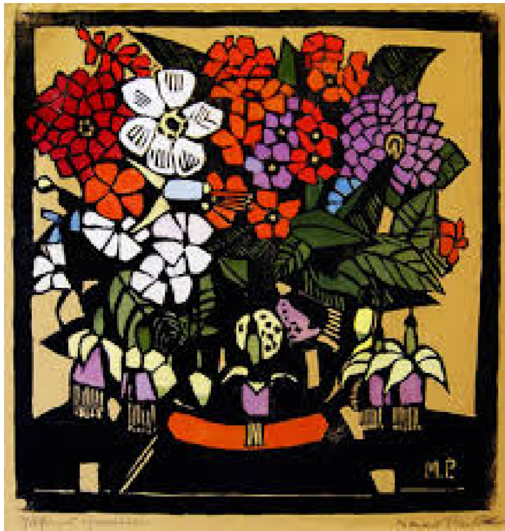
Art Sunday by Margaret Preston