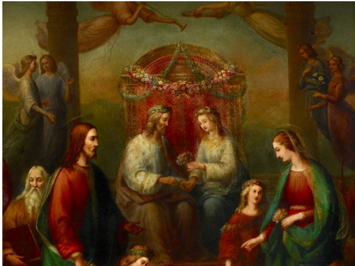
The marriage at Cana of Galilee by Adelaide Ironside