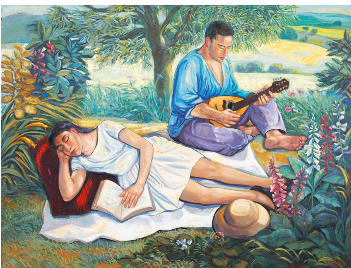
Psalm 52 - Sunday Afternoon Brandis