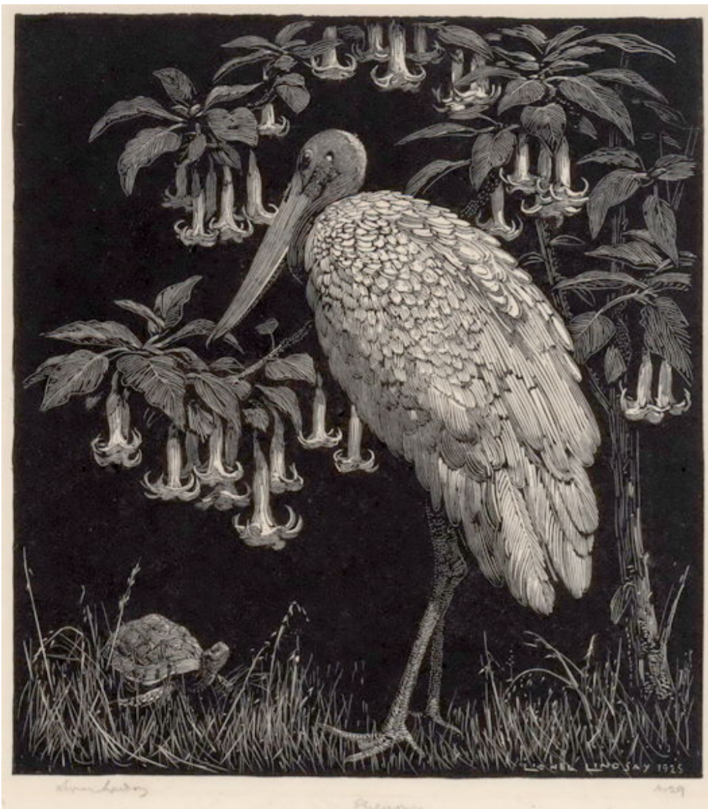
Philosophy by Lionel Lindsay