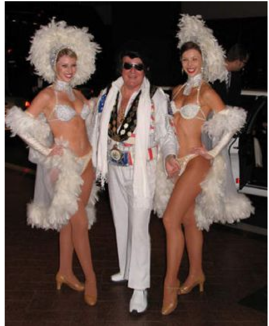
Sydney Morning Herald

Just before his untimely death, he was starting to put together a new show on Johnny O'Keefe, a good friend.